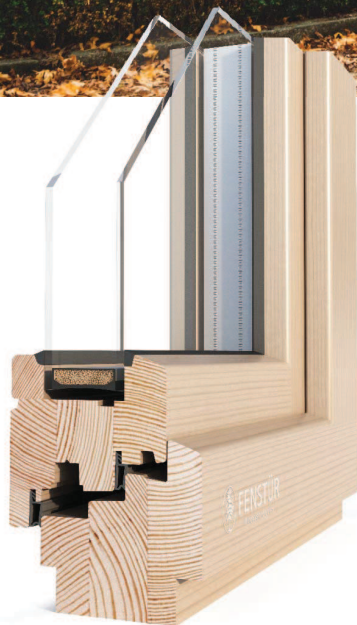
Wood tilt & turn