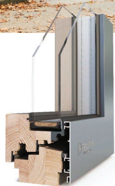
Wood - aluminium clad tilt & turn